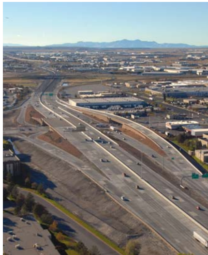
Lochner earns a ARTBA award for the design of SR-201 in Utah.

The SR-201 freeway runs through one of Salt Lake County's most commercialized areas and is a vital link for commuters and local businesses. Lochner's community relations efforts during the reconstruction of this major corridor were grounded on two main ideals. One was keeping a flexible approach based on public feedback. The other was mak-